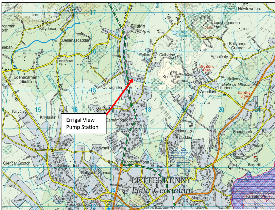
Figure 1.0: Location of the development

Presented in Figure 1.0 below is the location of the development.