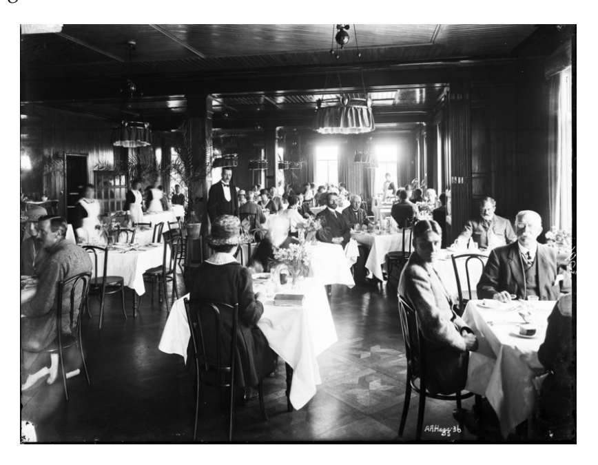
Figure 4: Rosapenna Hotel Dining Room with guests c.1919. A.R. Hogg Y654 © National Museums Northern Ireland

The A.R. Hogg photographic collection consists of glass negatives, original prints, lantern slides and photographic albums. Dating from c.1880 -1939, it holds material of topographical and industrial interest and includes a large number of named portraits. While all parts of Ireland are covered, the collection's focus is particularly strong in relation to Belfast and north-east Ulster. There are currently 109 photographs in the Hogg collection relating to Donegal.