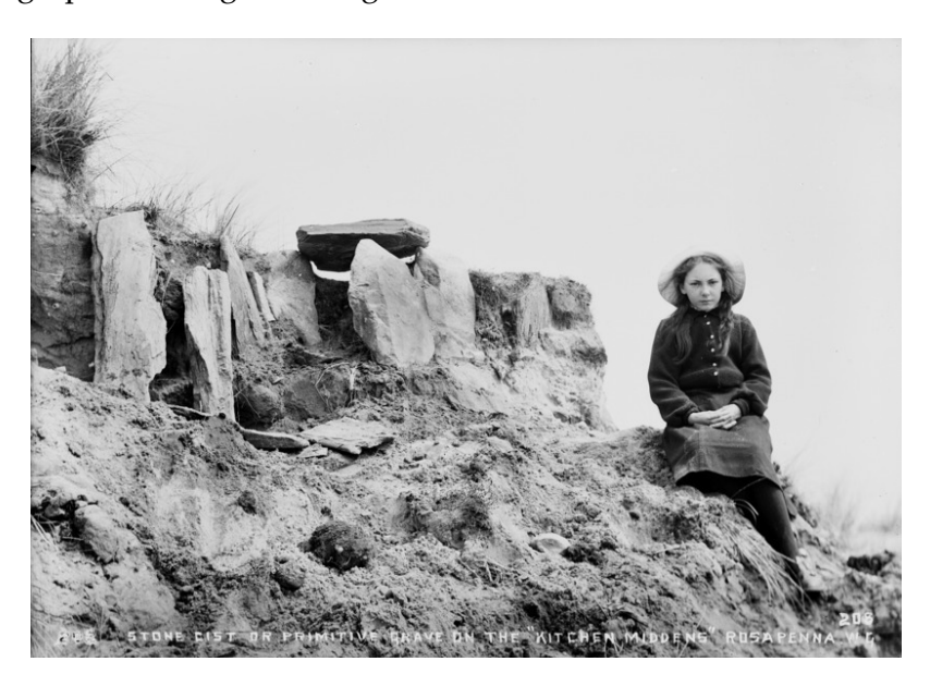
Figure 5: Stone Cist Or Primitive Grave On The "Kitchen Middens", Rosapenna. W.A. Green WAG0208. © National Museums Northern Ireland

The W.A. Green photographic collection consists of glass negatives, original prints, lantern slides and published series of views and dates from c.1880 – c.1940. It contains material of topographical, archaeological, industrial and transport interest but is particularly strong in regard to images of agriculture, rural life, crafts and pastime of the north of Ireland. There are currently 310 photographs relating to Donegal in the Green Collection.