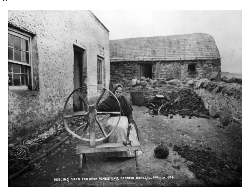
Figure 3: 'Reeling yarn for Irish Homespuns' R.J. Welch 1366 © National Museums Northern Ireland

The R.J. Welch photographic collection consists of glass negatives, original prints, lantern slides, original photographic albums and published series of views. Dating from c.1880 – c.1935, it contains material of topographical, scientific, anthropological, archaeological, transport and industrial interest, covering the whole of Ireland with particular emphasis on the north and west. There are currently 313 images in the existing Welch collection relating to Donegal.