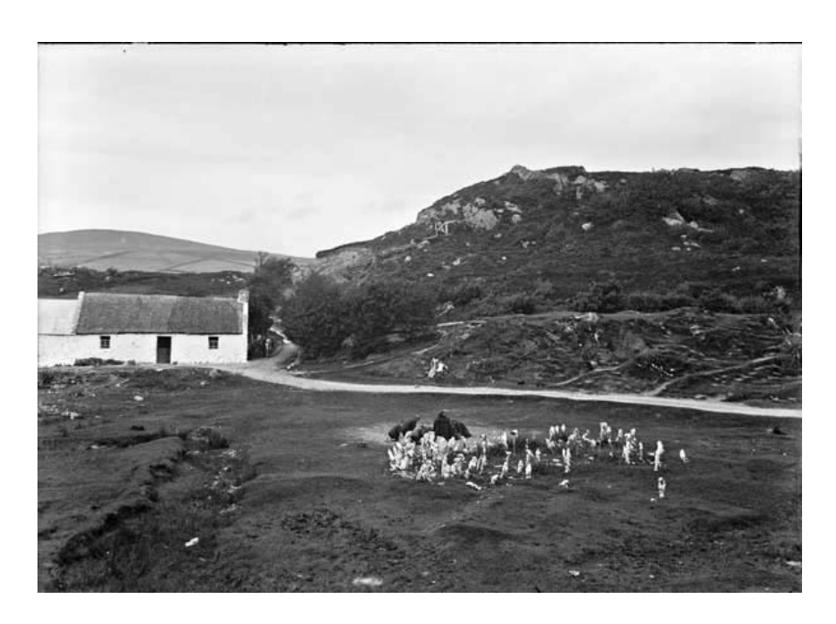
Figure 1: Doon Well, Termon (EAS_1042)

The Eason collection consists of 2,772 images of Ireland, originally created for the Irish postcard trade by Eason & Son between 1900 and 1940. Approximately 90 of these photographs were taken in various locations throughout Donegal.