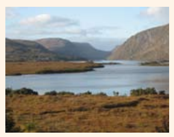
Glenveagh National Park

Rosses Community Library, Ionad Teampaill Chróine, Chapel Road, An Clochán Liath / Dungloe (074) 952 2500