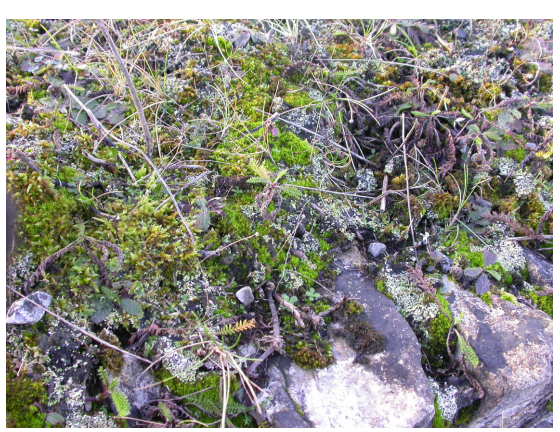
Plate 10: Highly diverse flora of specialised lichens, mosses, grasses and small perennials. This is on an old lime mortar surface.

Note: These three photographs were all taken in mid-winter on a single stretch of less than five metres of bridge parapet.