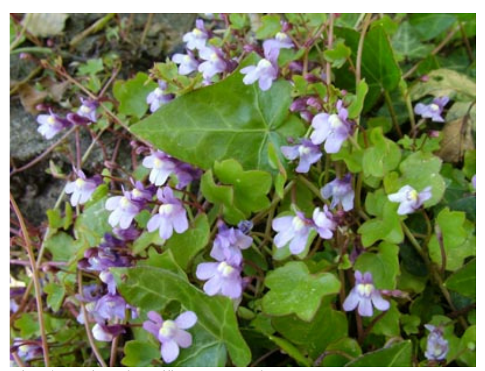
Plate 4: Ivy-leaved Toadflax among Ivy leaves

Other sources of variation include aspect, and the amount of moisture falling onto, or retained on, wall surfaces. For example, cushion-forming mosses (which maintain their own micro-climate within the cushions) prefer north-facing surfaces, whereas the pleurocarpous (tending to flatter) mosses prefer the south. Crustaceous lichens and cushion-forming mosses tend to be the pioneer plants in dry situations, while algae start colonization on damp walls.