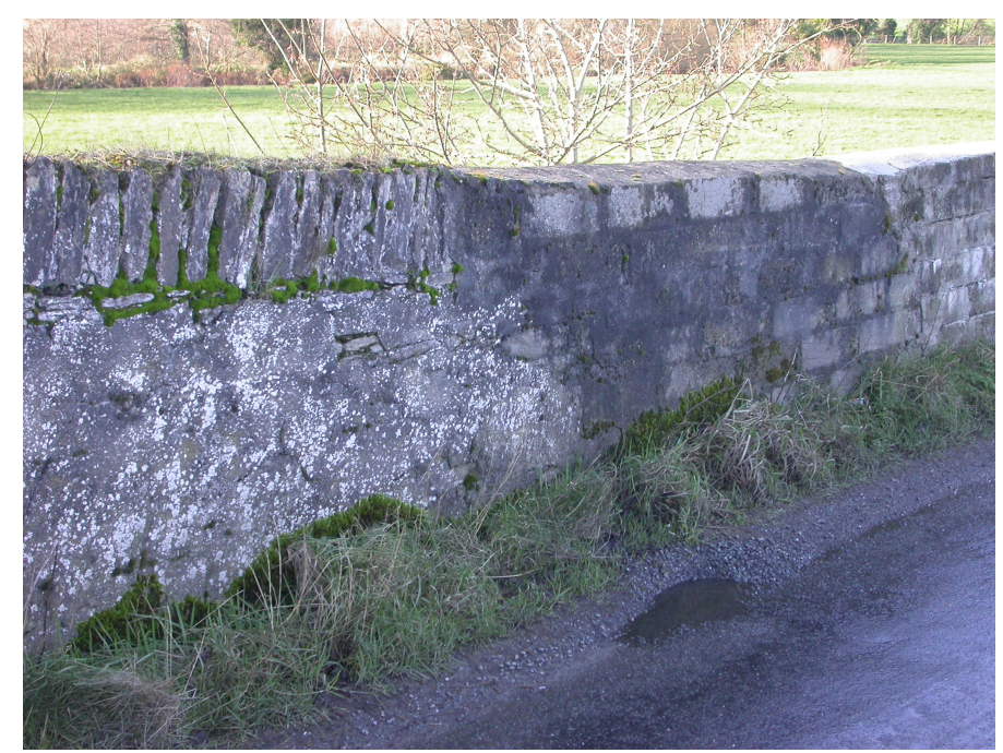
Plate 2: The Old and the New – Beltany Bridge on the River Deele