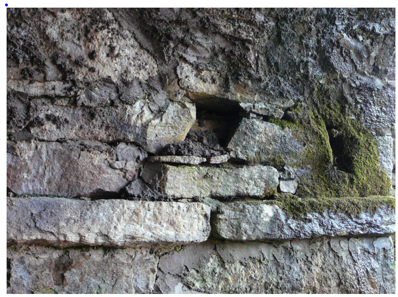
Plate 6: Ledge and hole created for Dipper's nest