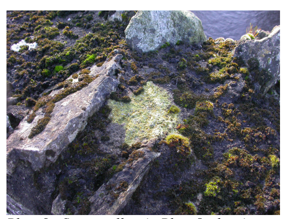
Plate 9: Same wall as in Plate 8, showing rapidly colonising mosses and lichens on a new surface of lime mortar.