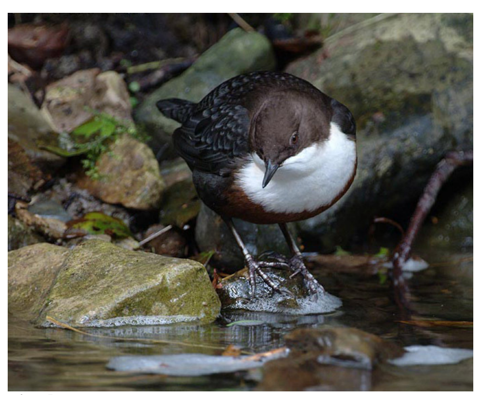
Plate 5: Dipper

The Grey Wagtail is also confined to the same sort of streams as the Dipper, but is not as dependent on bridges as the Dipper. It will build its nest in Ivy or other dense vegetation. Wrens will do likewise, but in addition they can often roost in crevices under arches normally occupied by bats (see below).