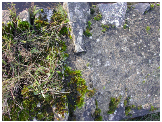
Plate 8: Diverse flora on parapet, contrasting with sterile cement replacement