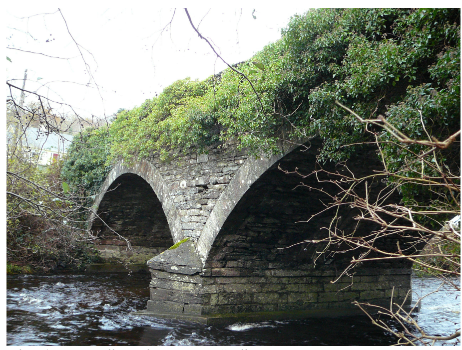
Plate 1: New Mills Bridge on River Swilly

Cover Photograph: Clady Bridge – the lowest crossing on the River Finn, and listed on the Record of Protected Structures.