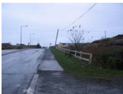
Bunbeg / Derrybeg Pre-Construction