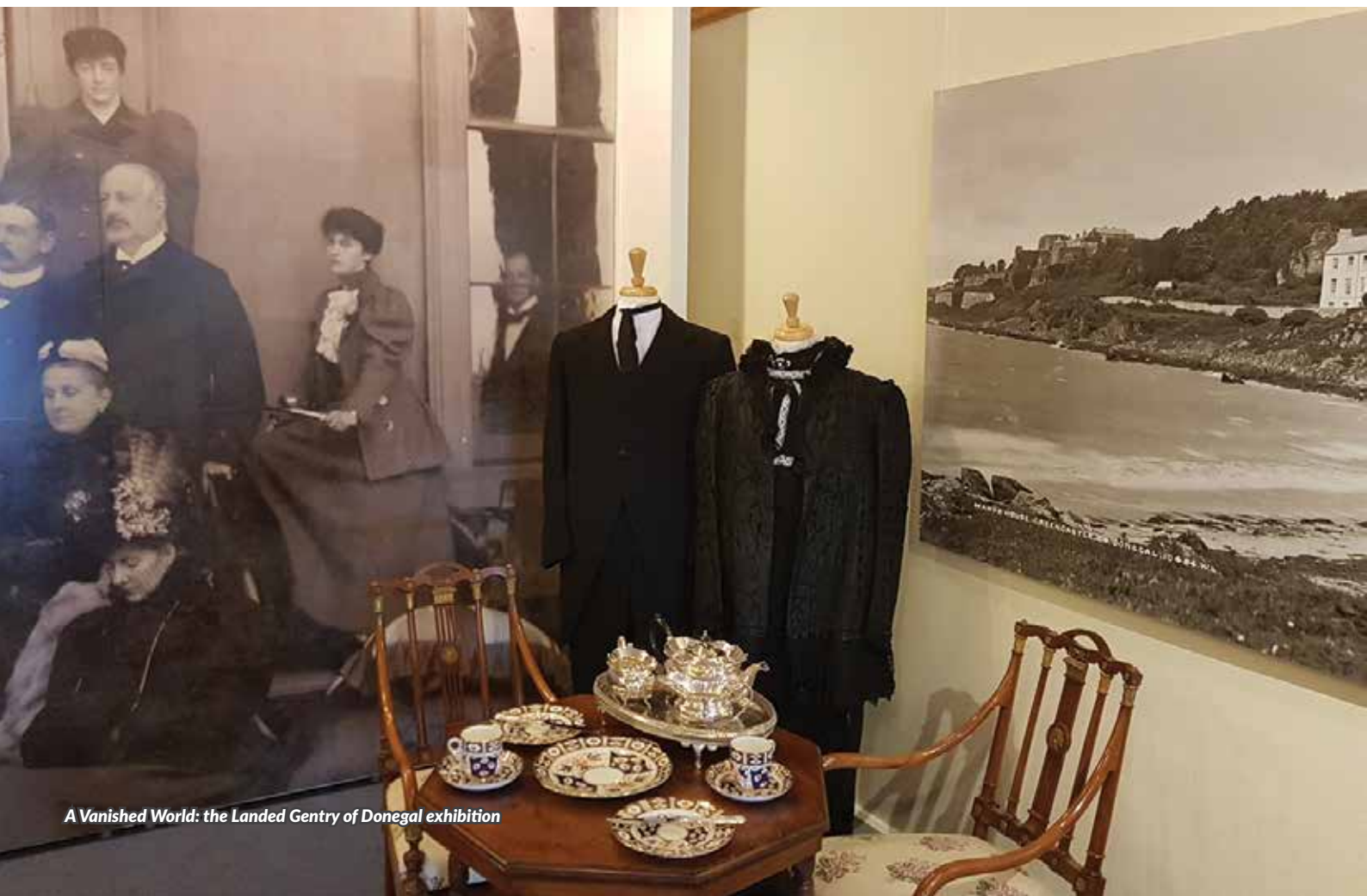
A Vanished World: the Landed Gentry of Donegal exhibition

The Museum organised events during the Bealtaine Festival, Heritage Week, Culture Night and Wainfest.