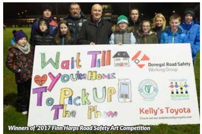
Winners of 2017 Finn Harps Road Safety Art Competition

Finn Harps FC also continued to support Road Safety through the Primary School Road Safety Art competition. Donegal County Council was awarded the "Road Safety Award