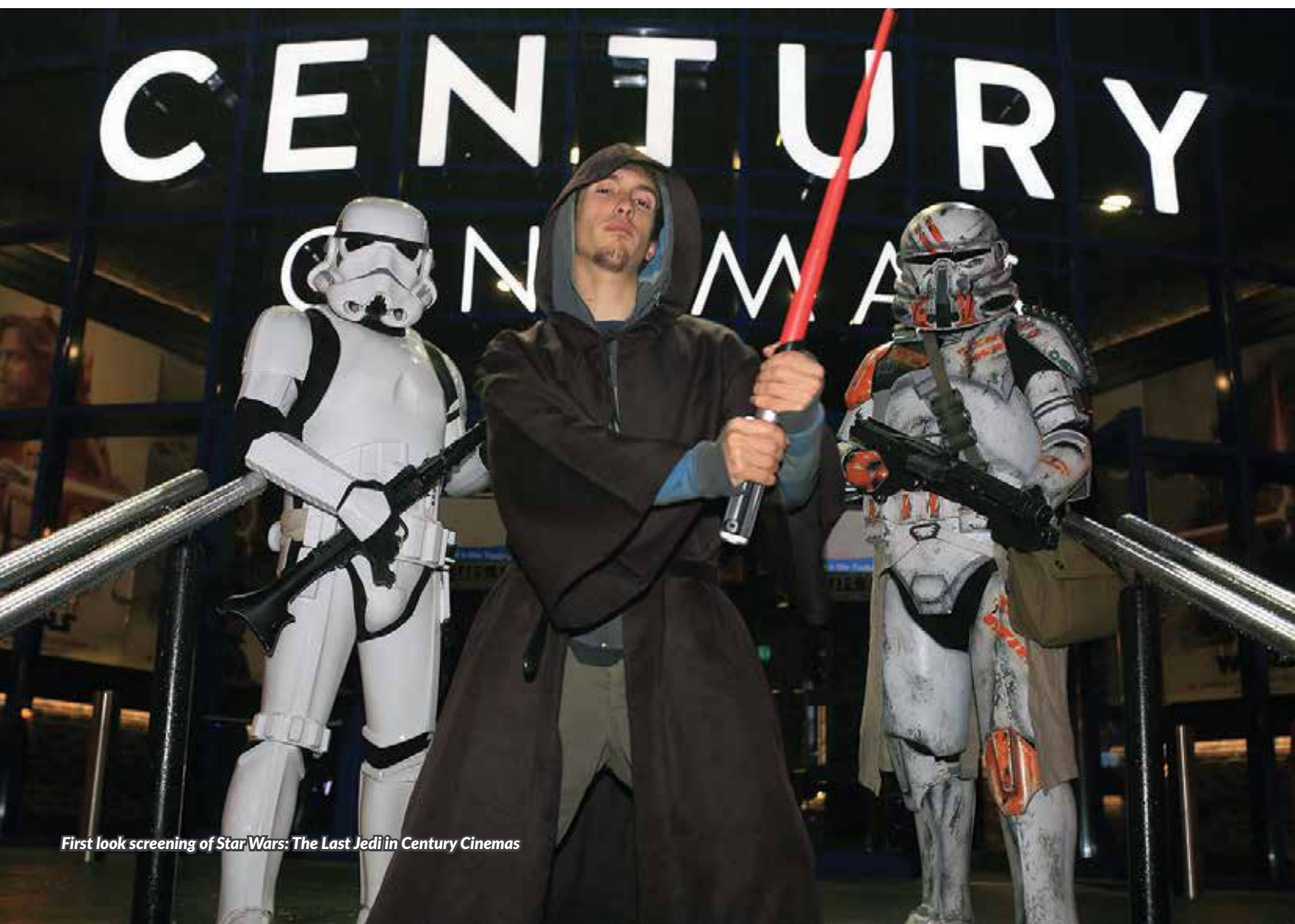
First look screening of Star Wars: The Last Jedi in Century Cinemas

The first look screening of Star Wars: The Last Jedi took place in Century Cinemas in Letterkenny in December and over 200 invited guests were invited. In May 2016, Malin Head was one of a number of locations across the world where scenes from Star Wars: The Last Jedi was filmed.