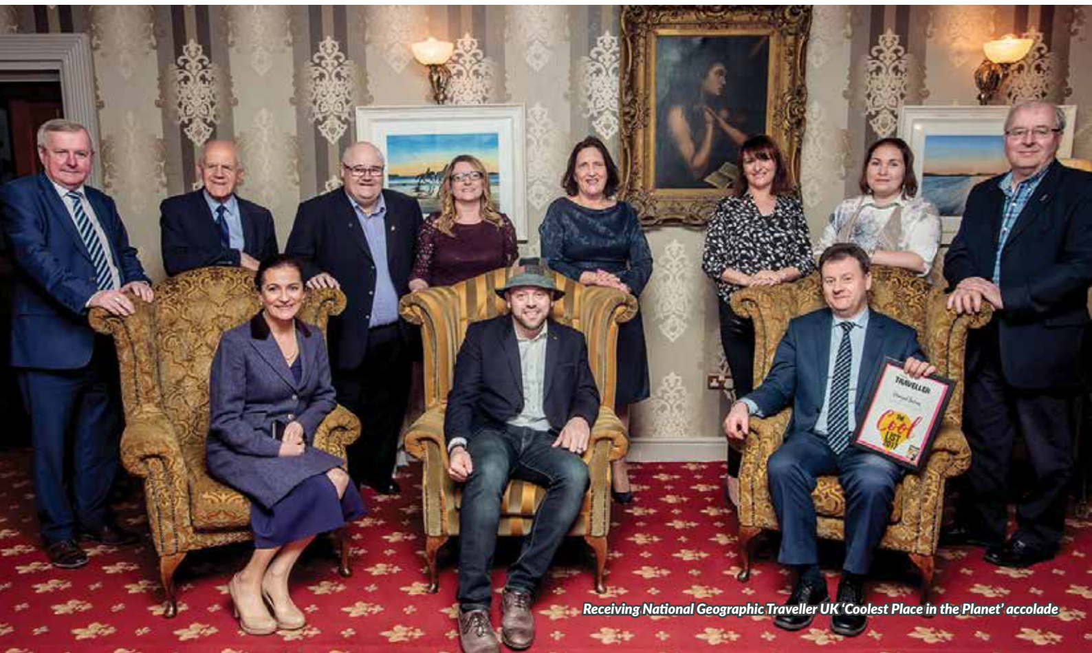
Receiving National Geographic Traveller UK 'Coolest Place in the Planet' accolade