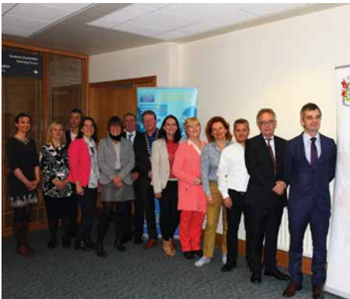
ERNACT Interregional Management Committee held in Donegal in September

Participation continued, via the ERNACT ( www.ernact.eu ) network, in co-operative EU projects. The CLEAN project was launched in April with a focus on energy efficiency in public buildings.