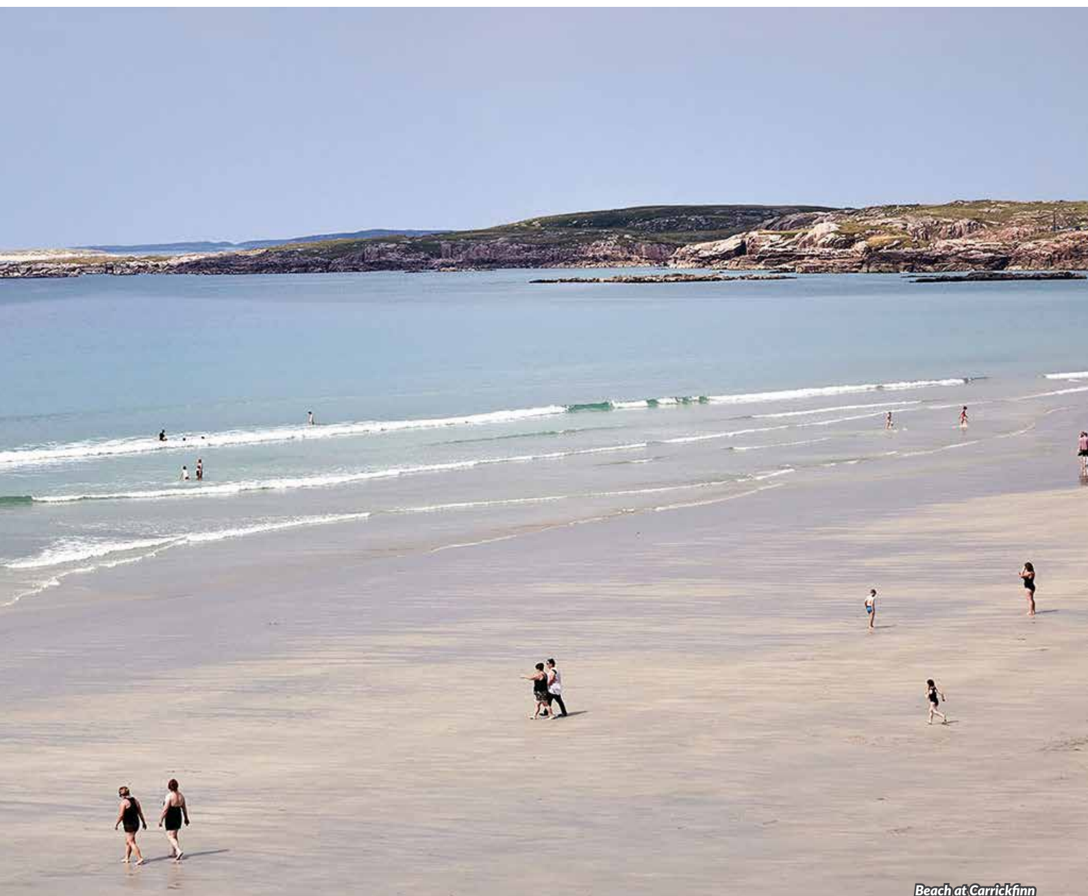
Beach at Carrickfinn

Planning permission was secured on a large number of water and wastewater facilities.