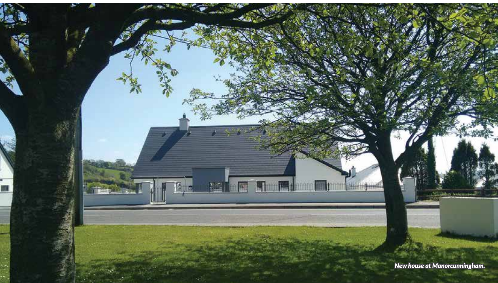
New house at Manorcunningham.