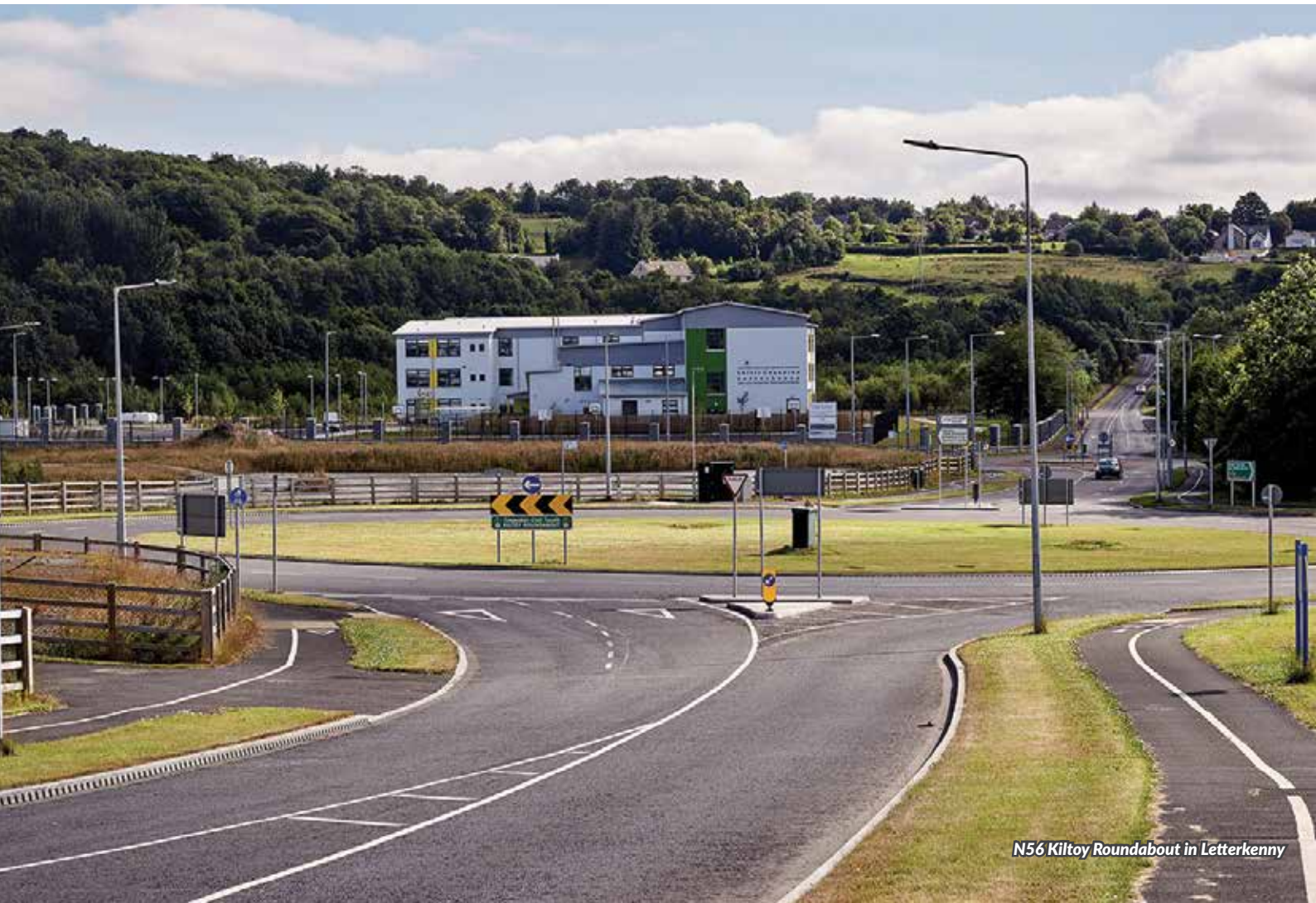
N56 Kiltroy Roundabout in Letterkenny