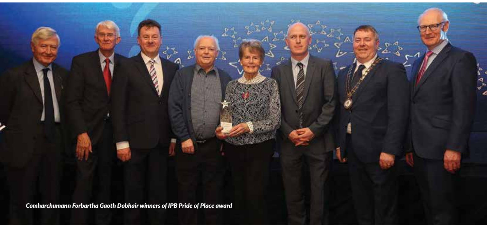
Comharchumann Forbartha Gaoth Dobhair winners of IPB Pride of Place award

Comharchumann Forbartha Gaoth Dobhair came out top in the Creative Place Initiative while Letterkenny Youth and Family Services were runners up in the Category 8 - Community Reaching Out Initiative and Oileán Thoráí Tory Island were runners up in Category 10 - the Islands and Coastal Communities.