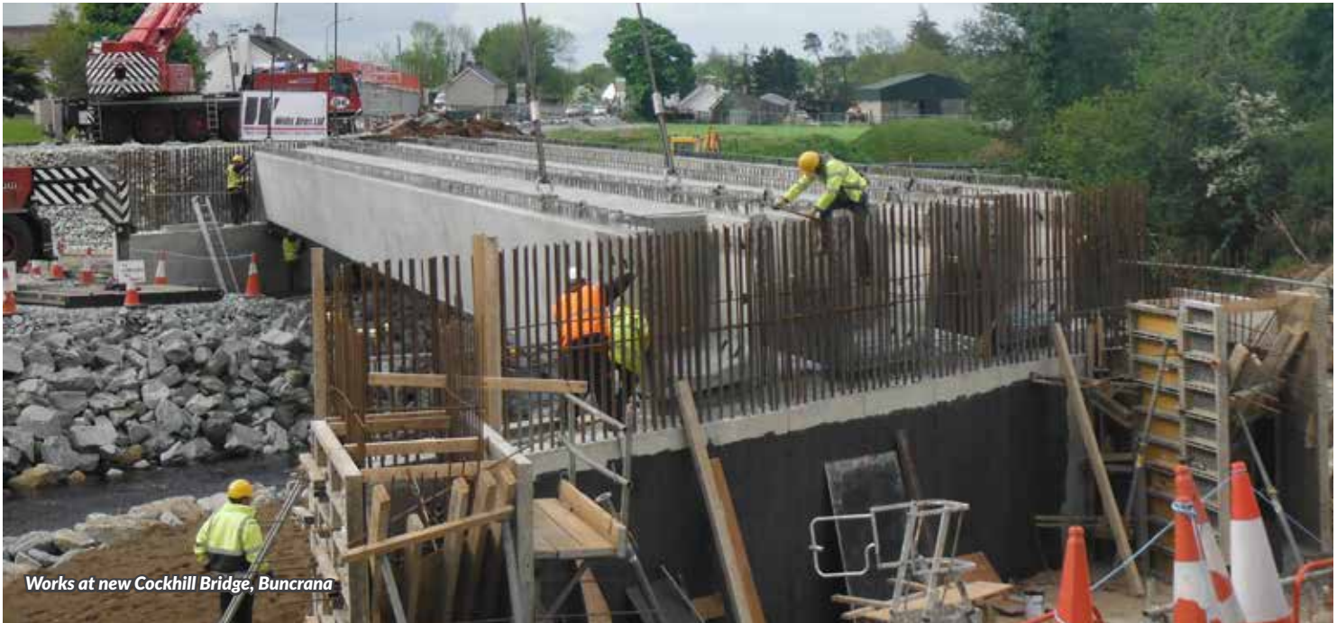
Works at new Cockhill Bridge, Buncrana