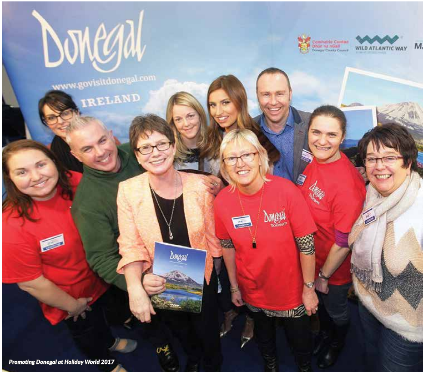
Promoting Donegal at Holiday World 2017

A broad range of tourism related activities and events were delivered including: