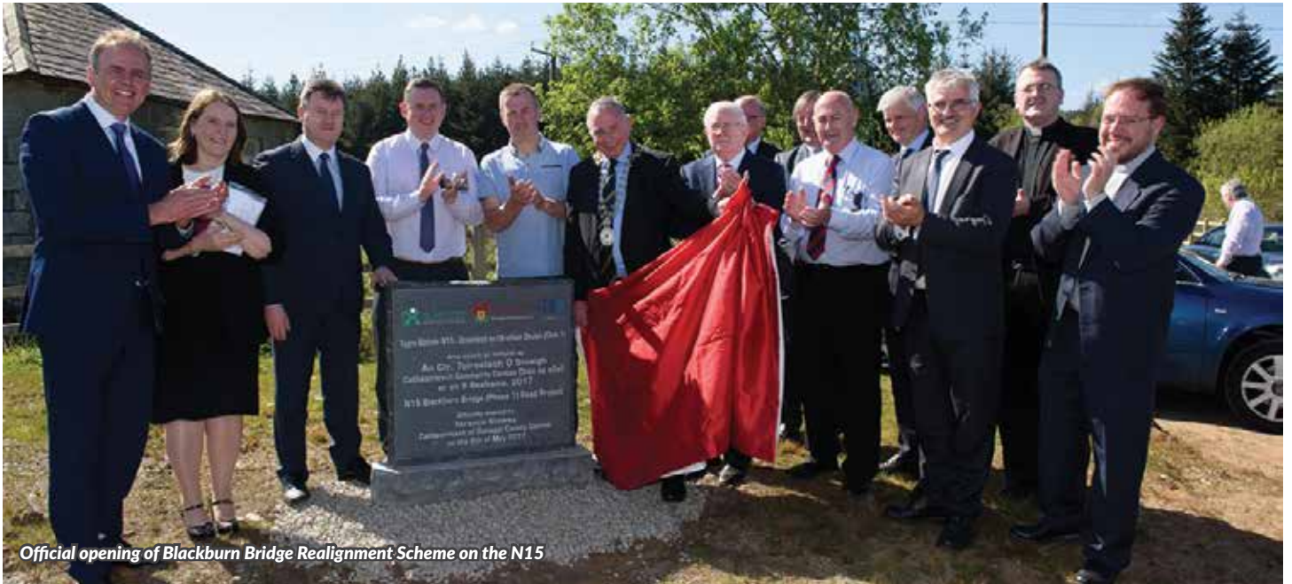
Official opening of Blackburn Bridge Realignment Scheme on the N15

There was a considerable increase in overall levels of activity in both design and construction on National Roads. TII invested in excess of €19m in National roads in Donegal in 2017. The Donegal National Roads Office has delivered substantial improvements on the National Road network through this funding and continues to progress further significant projects.