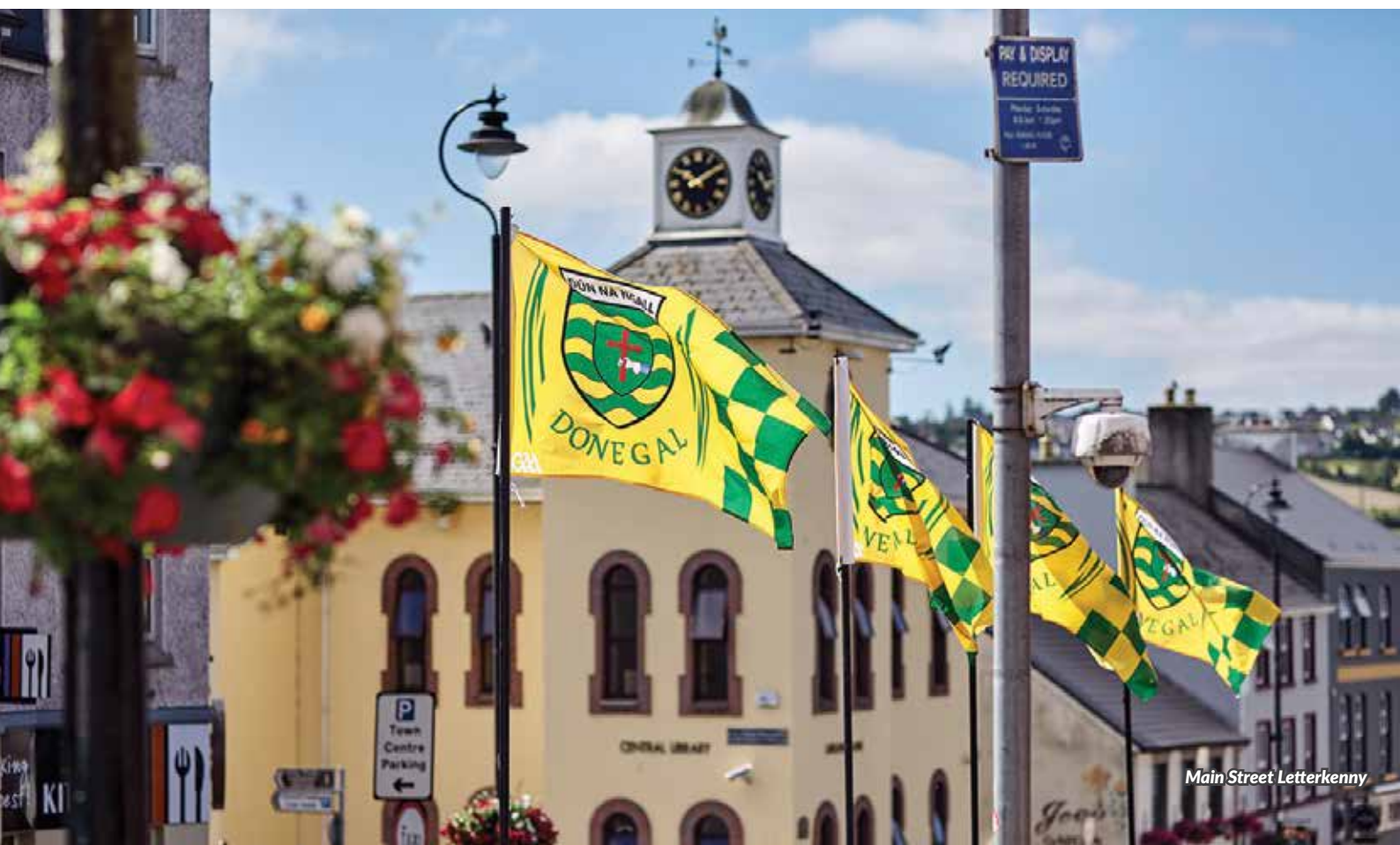
Main Street Letterkenny

A new Central Invoice Matching (CIM) Team was constituted.