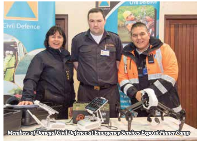
Members of Donegal Civil Defence at Emergency Services Expo at Finner Camp