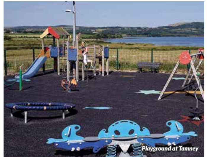
Playground at Tamney

In January, rates bills were issued to 5,325 businesses and the combined total of the rates bills was €30.3m. The value of the individual rates bill varied greatly with only 25% of properties having a bill of more than €4,359 in 2017, which represented 1,362 of the total properties. Cash collected totalled €26.4m, and over €3m was deemed as not collectable as the property was not occupied for all or part of the year.