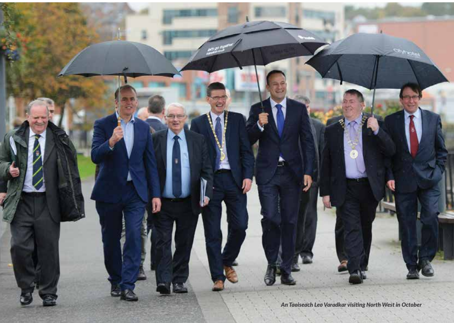
An Taoiseach Leo Varadkar visiting North West in October

An Taoiseach Leo Varadkar visited the North West in October endorsing the North West regional growth structures and reaffirming the Government's commitment to delivering on the strategic growth priorities for the region.