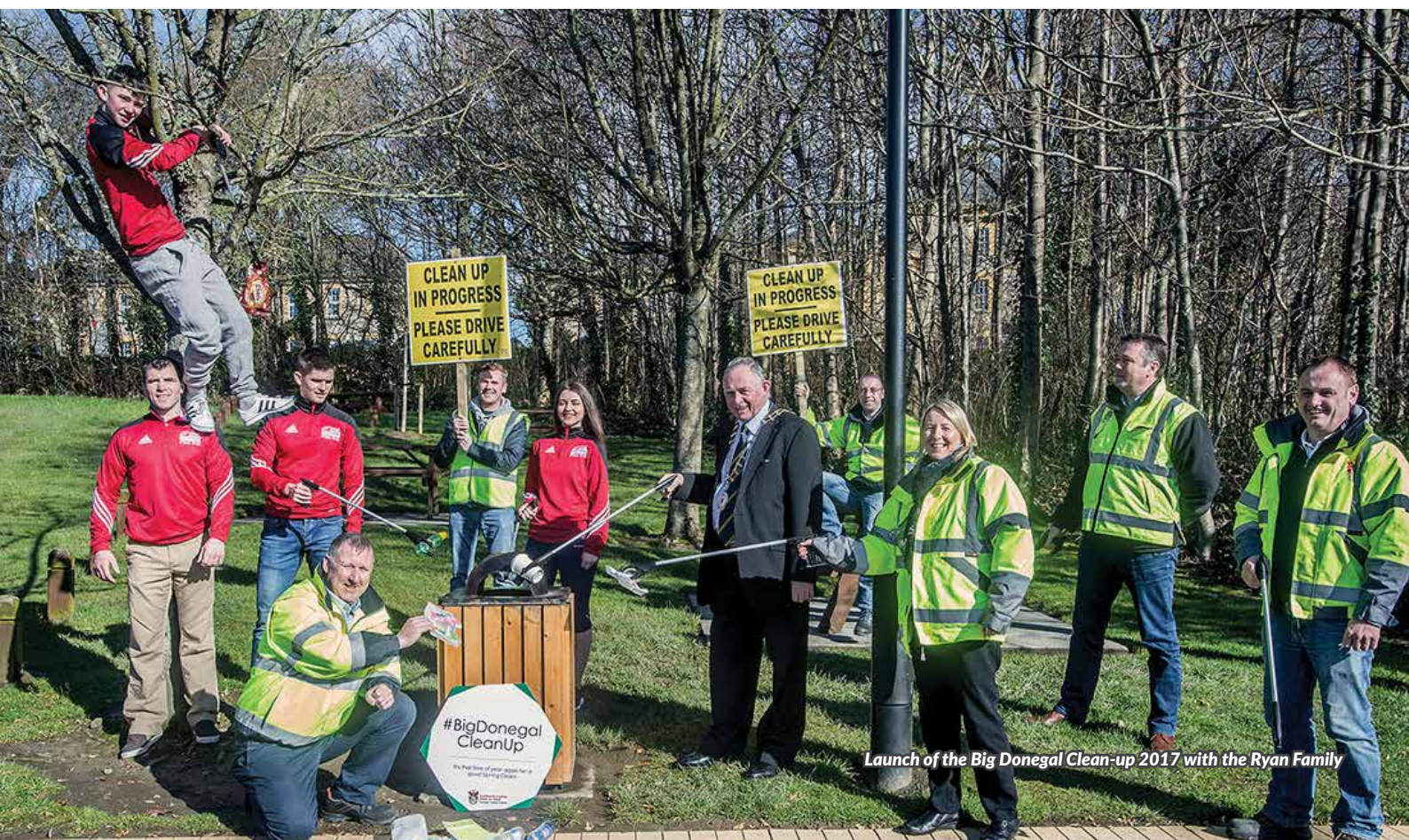
Launch of the Big Donegal Clean-up 2017 with the Ryan Family

The roll out of the brown bin for compostable waste is in the process of being expanded.