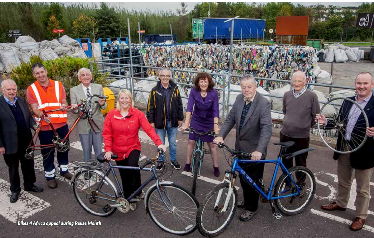
Bikes 4 Africa appeal during Reuse Month

The Council engaged with the Probation Service and this service worked with a number of Tidy Towns groups.