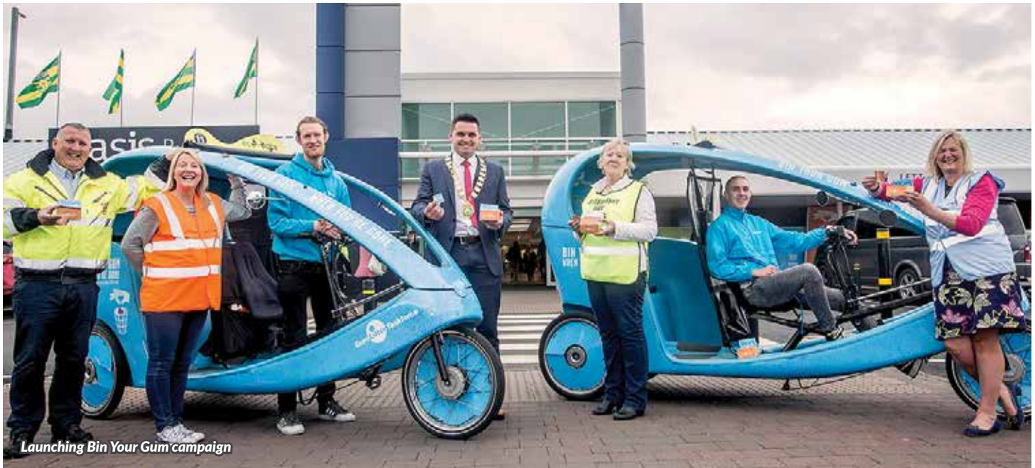
Launching Bin Your Gum campaign

Waste Facilities are authorised by Donegal County Council to recover waste in the county. These include private sector facilities providing recycling and waste disposal services.