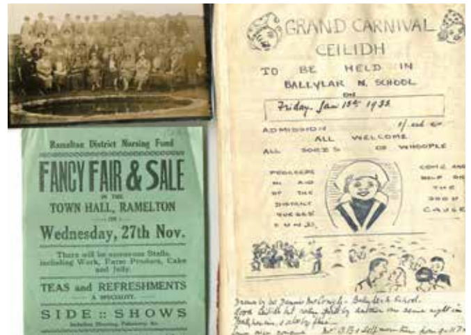
Fanad Health Club Archive Collection

A series of events was organised to commemorate the Decade of Centenaries and as part of the Creative Ireland programme for Donegal. The updating of the County Donegal Book of Honour continued and in November the Museum worked with