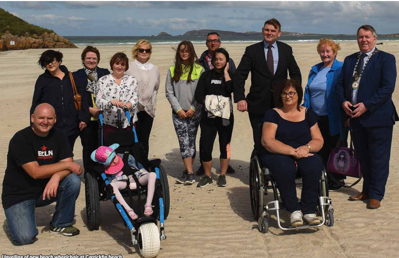
Unveiling of new beach wheelchair at Carrickfinn beach