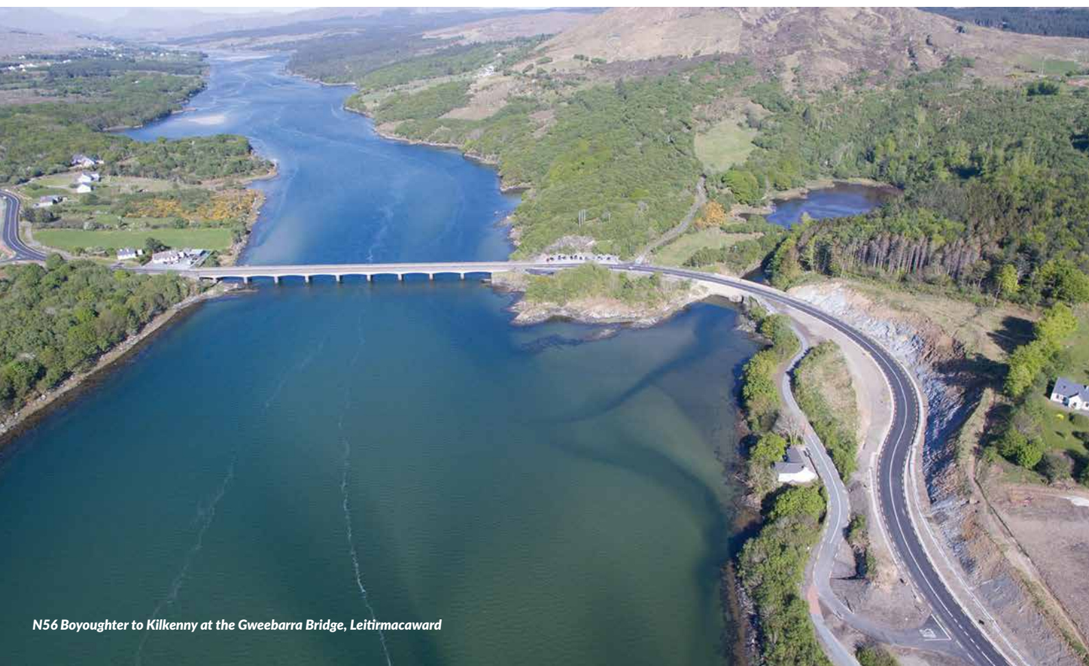
N56 Boyoughter to Kilkenny at the Gweebarra Bridge, Leitrimacaward

This funding allowed the Roads Division to undertake a variety