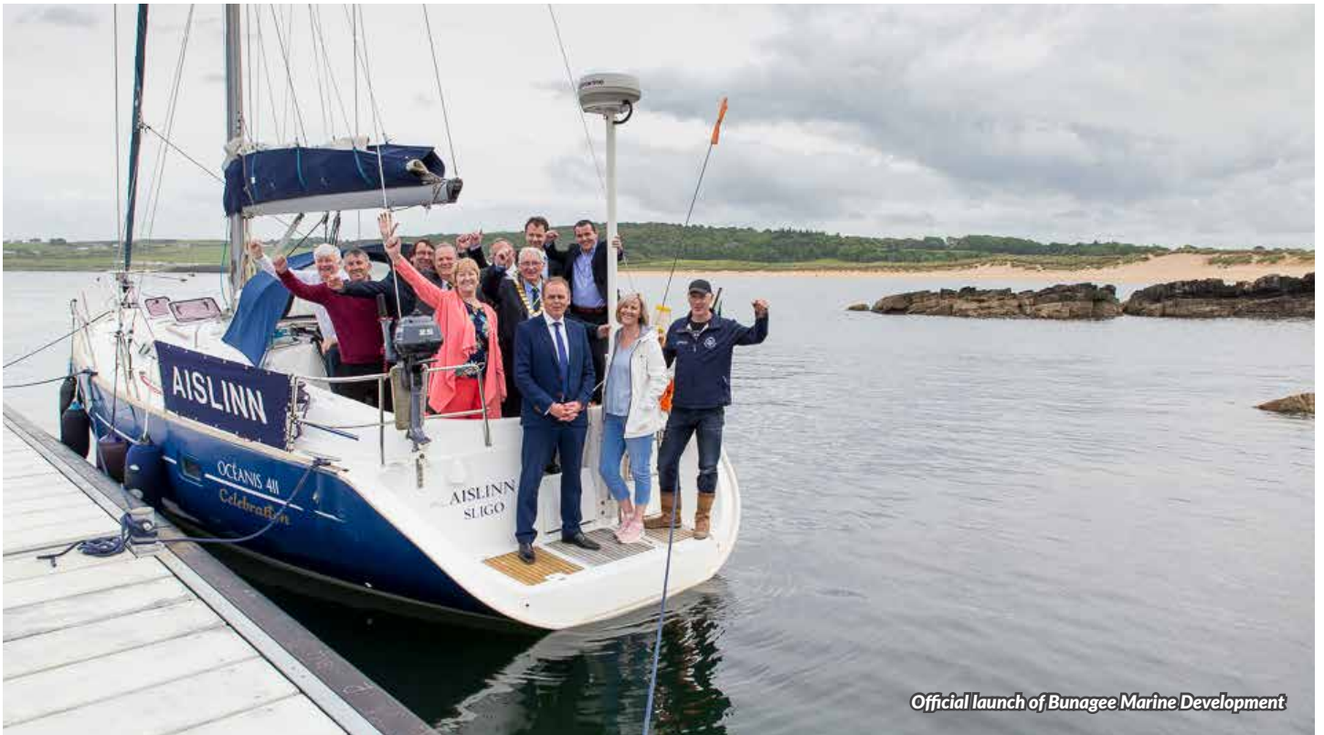
Official launch of Bunagee Marine Development

2017 in the Excellence in Business Awards by the Public Sector Magazine". This is the third year in succession that the Council won this award.