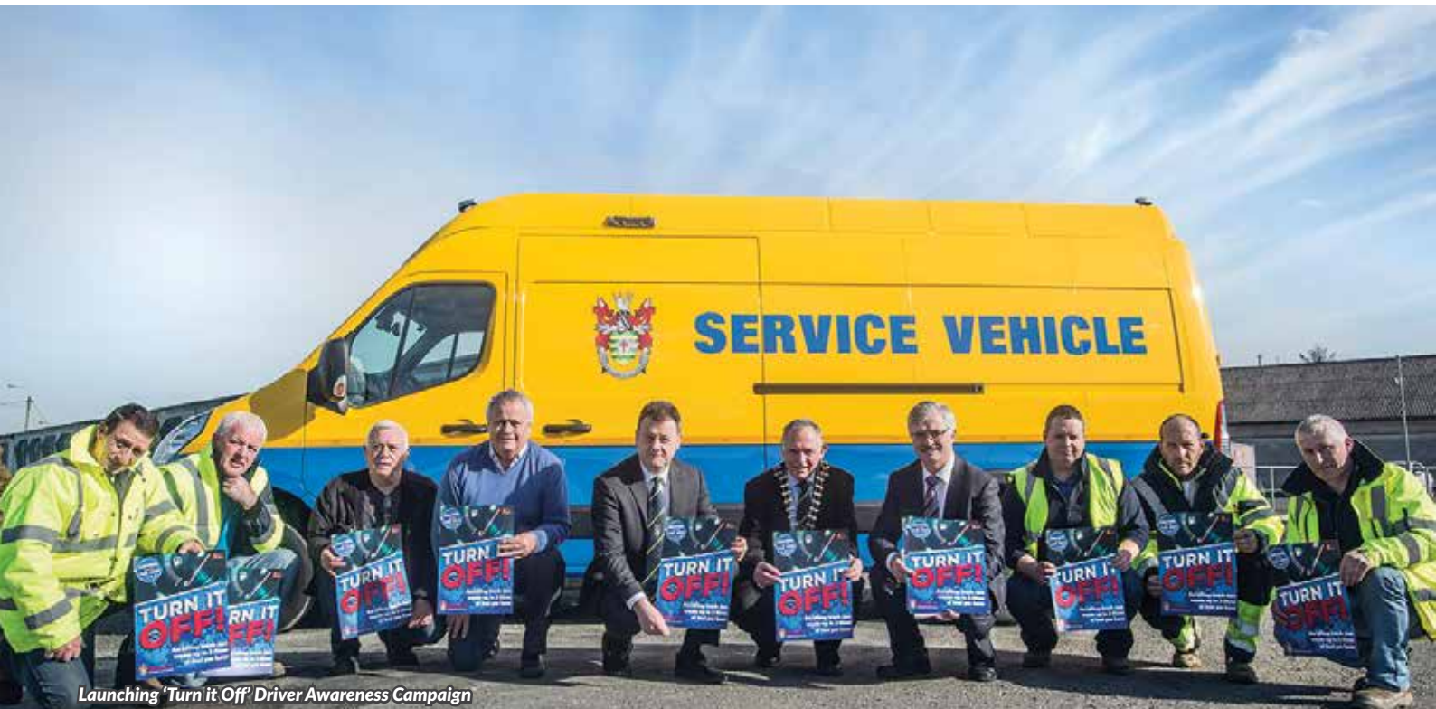
Launching 'Turn it Off' Driver Awareness Campaign

This was part of the Council's drive to improve energy performance throughout all operations.