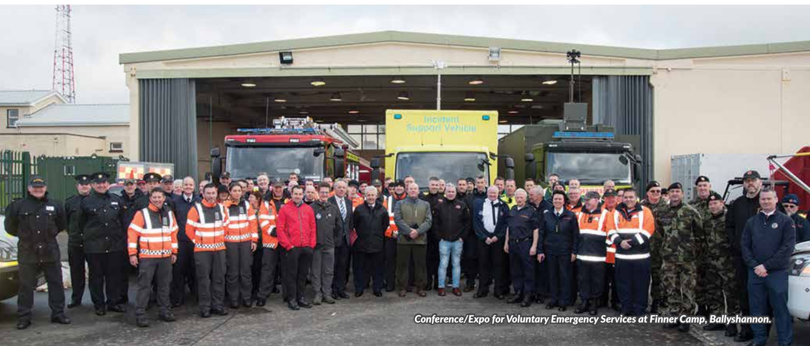
Conference/Expo for Voluntary Emergency Services at Finner Camp, Ballyshannon.

Each retained brigade has two, three hour drills each month. The drills are both lecture room and activity based and cover a spectrum of training activities.