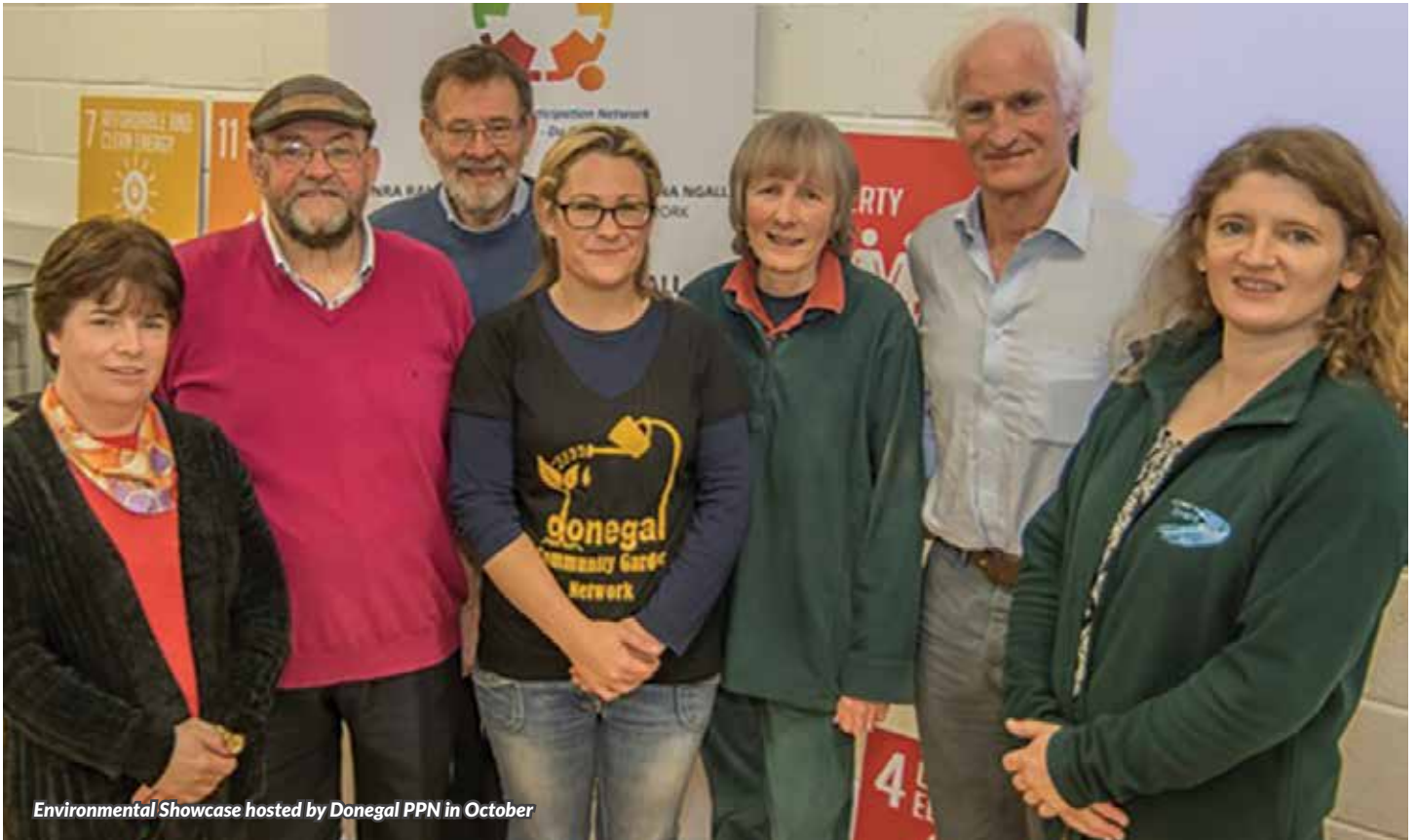
Environmental Showcase hosted by Donegal PPN in October