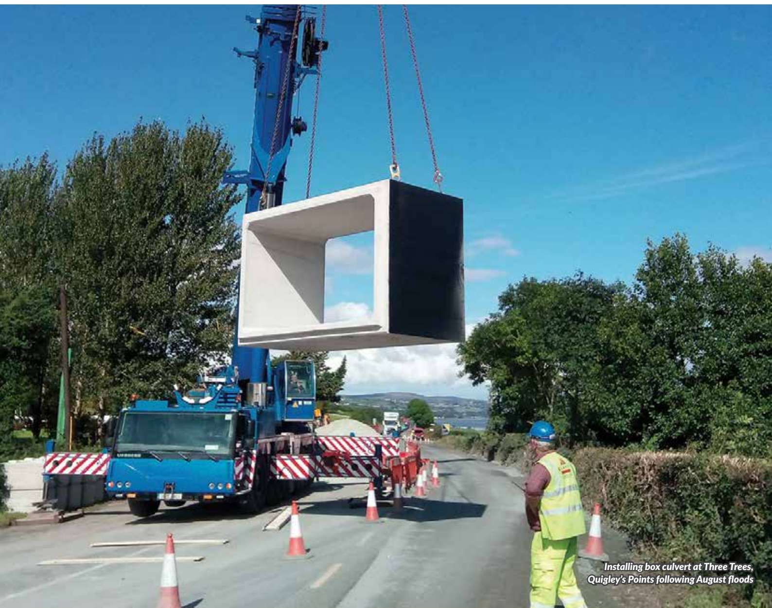
Installing box culvert at Three Trees, Quigley's Points following August floods

The Council's winter gritting programme is one of the most extensive in the country and in excess of 1,000km of our road network is routinely gritted each winter. The cost of winter gritting for the calendar year was approximately €1.2m.