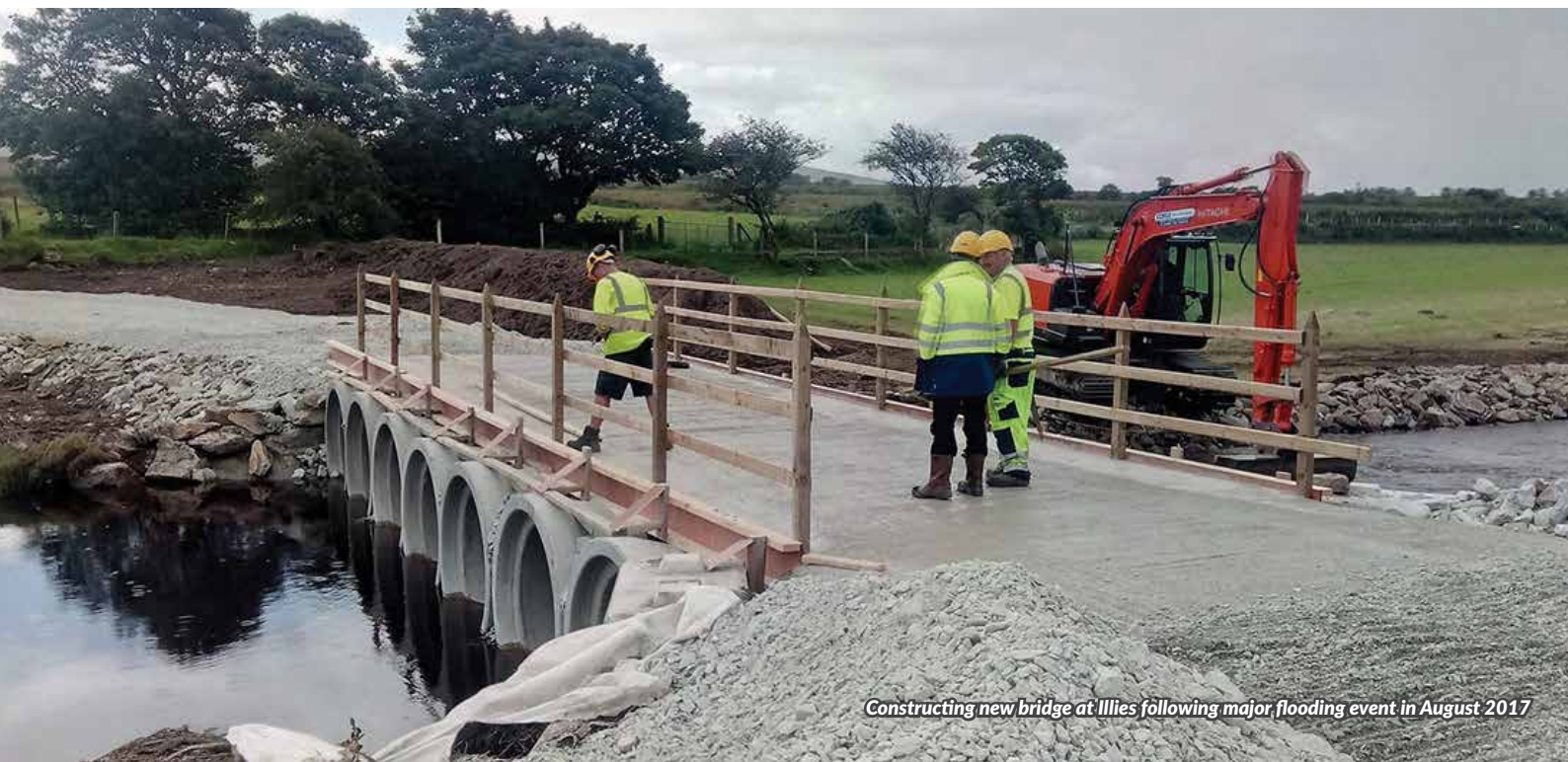
Constructing new bridge at Illies following major flooding event in August 2017

The RMO is funded by all authorities, DTTAS and TII and its budget was €2,519,698 for 2017.