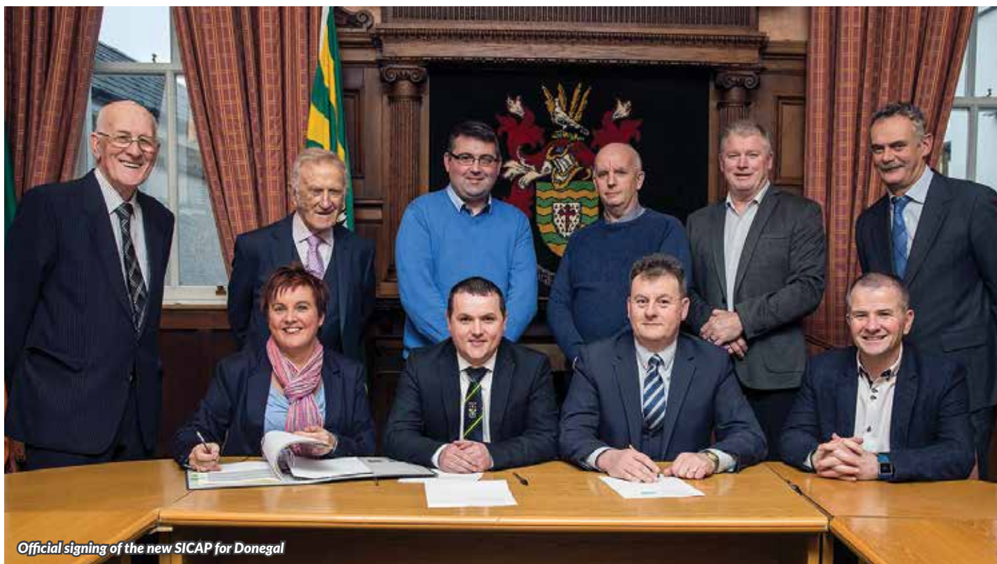
Official signing of the new SICAP for Donegal