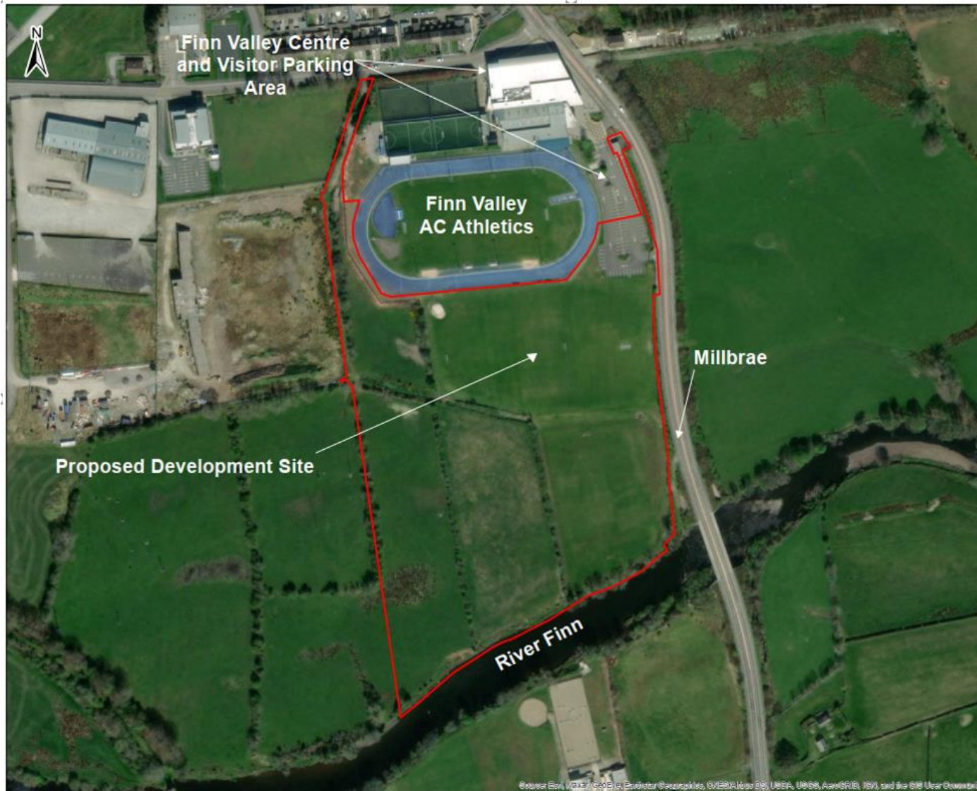
Figure 4-2: Stranorlar Multi-Use Sports Facility Improvement Project – Proposed Red Line Boundary