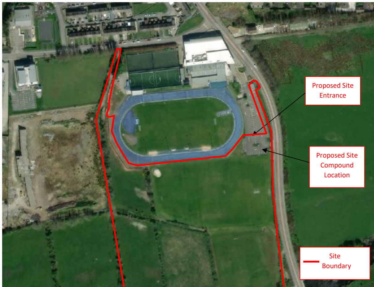
Figure 5.1 – Site Location & Existing Infrastructure