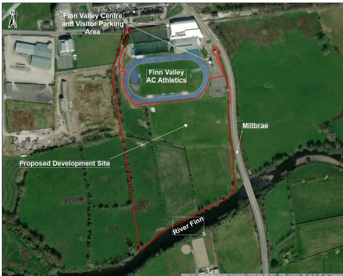
Figure 1-1 Site Location Map

The proposed multi-use sports facility improvement development site is bound by Millbrae to the east, the Finn Valley AC athletics track to the north and the proposed Finn Harps Stadium site to the west as shown in Figure 1-1 below. The River Finn is approximately 65m to the south of the proposed pitch location.