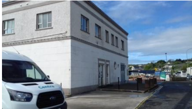
Island House from Shore Road side

The proposed development in relation to layout, design and location of physical interventions respects the surrounding operational activities of the harbour and piers by avoiding physical barriers or change that would impede day-to-day marine related activity.