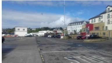
Island House and the Diamond