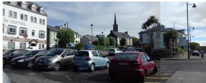
The Diamond, Killybegs