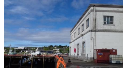
Island House from pier edge