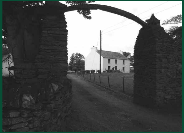
Second-Class House Cashel, Gortahork