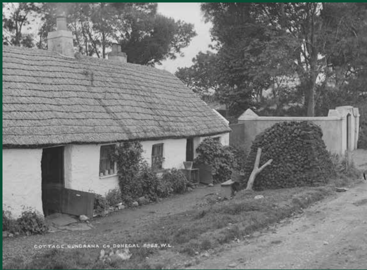
Third-Class House Buncrana