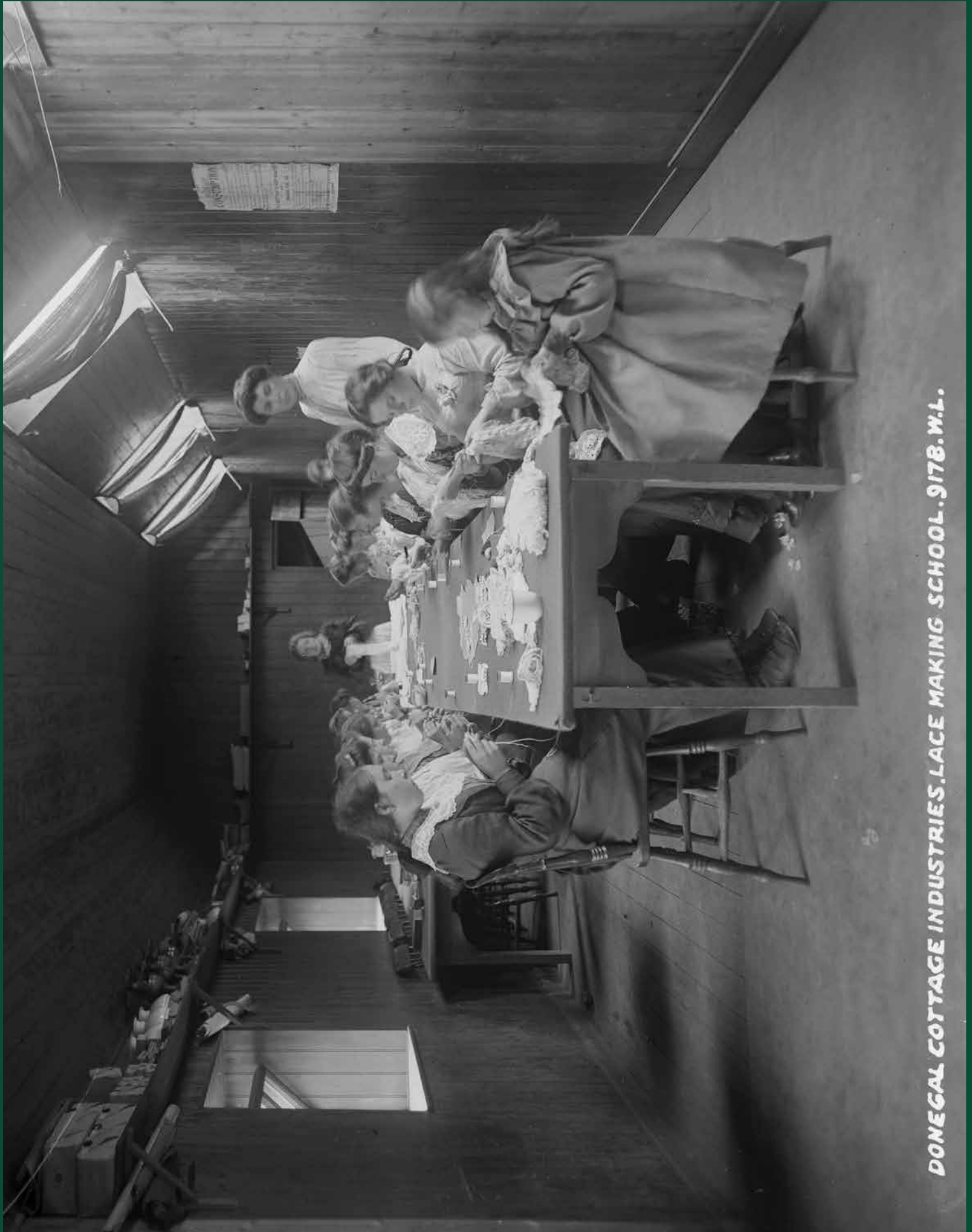
DONEGAL COTTAGE INDUSTRIES.LACE MAKING SCHOOL.9178.W.I.