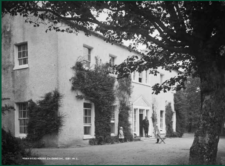
First-Class House Horn Head House, Dunfanaghy