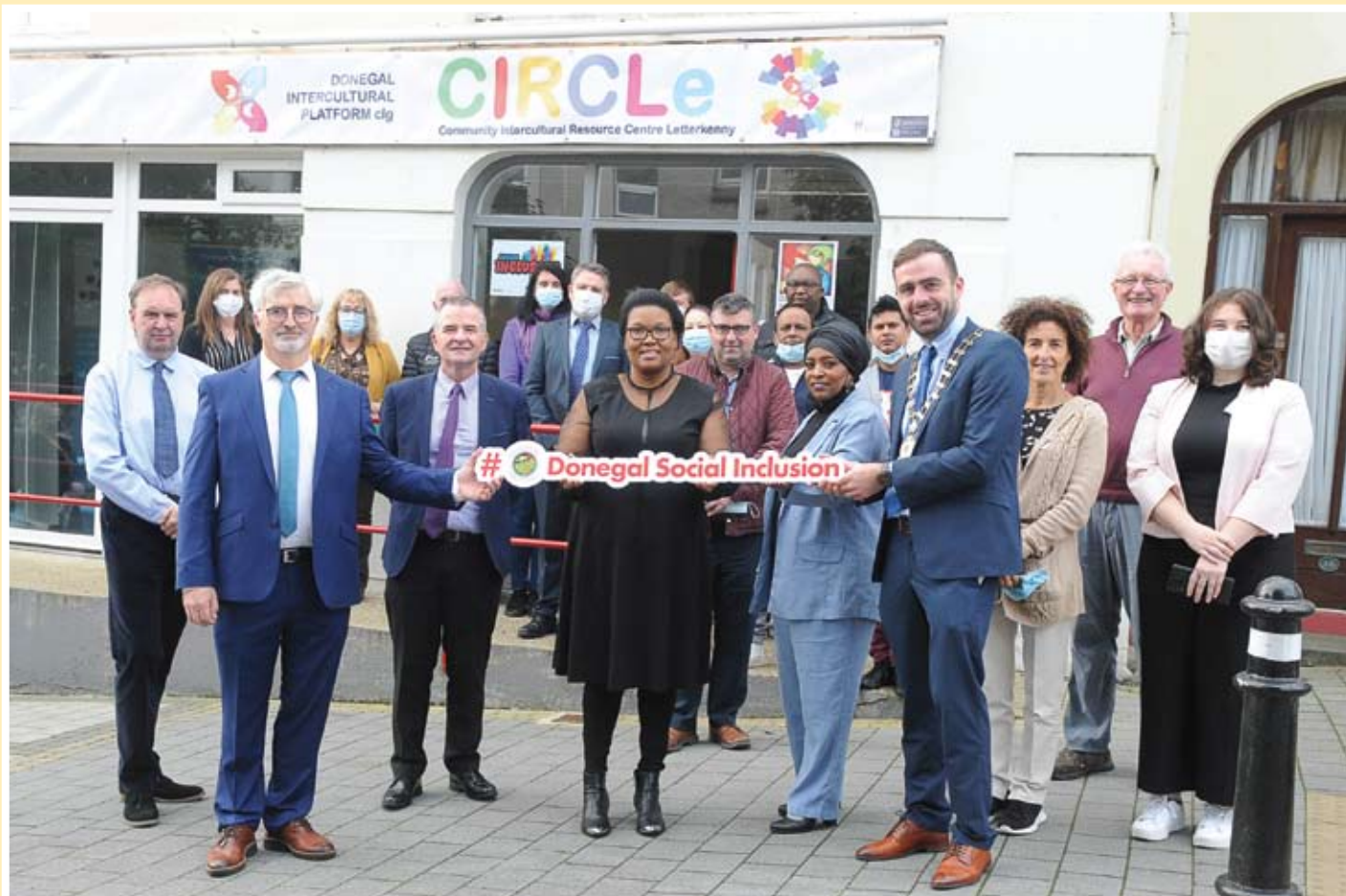
Social Inclusion Launch 21