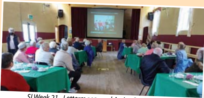
SI Week 21 - Lettermacaward Active Seniors Event