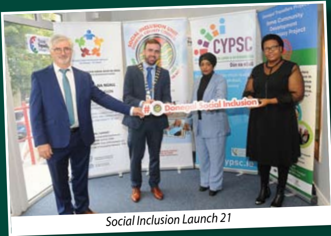
Social Inclusion Launch 21