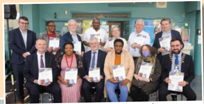
Black & Minority Ethnic Inclusion Launch