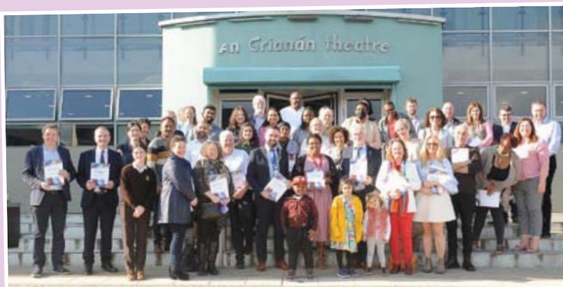
Black & Minority Ethnic Inclusion Launch