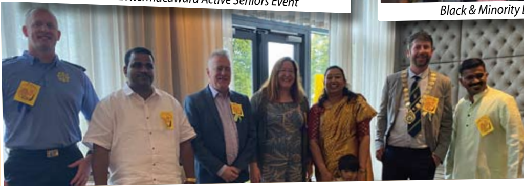
Onam Ponnonam 2022 - Indian Harvest festival