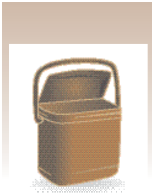
+ kitchen caddy

Some collectors might provide you with a kitchen caddy