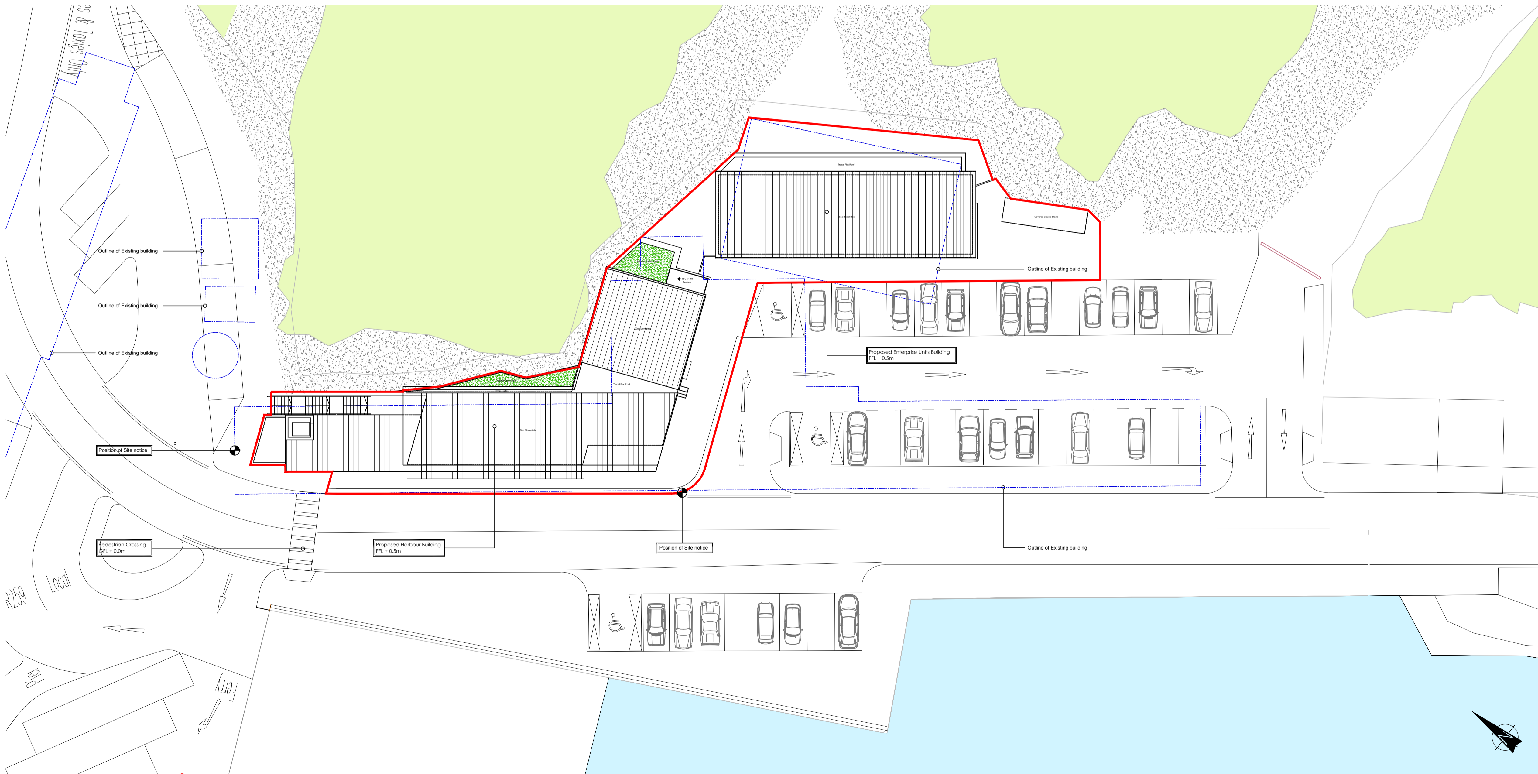
Site Layout Scale 1:200 Site Area = 0.091 Hectares (c. 0.22 Acres) Proposed Site Outlined in RED