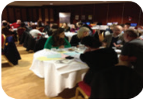
PEACEPLUS workshop in stage three of codesign