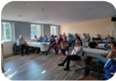
At the start of a co-design workshop at Cill Charta GAA Hall in Kilcar