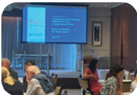
DCC PEACEPLUS Workshop Donegal Town