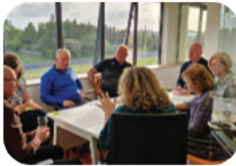
A workshop group talking priorities for their area