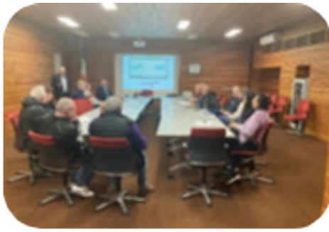
A co-design workshop at Letterkenny Public Services Centre