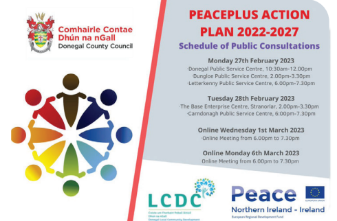
One of the workshop promotional tweets