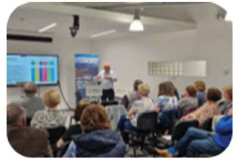
One of the 48 workshops putting the codesign process into the PEACEPLUS context, this time in the Gaeltacht area of Glenties.