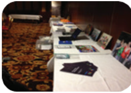
One of the display tables during codesign sessions