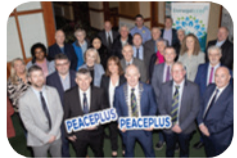
PEACEPLUS Consultation launch with Donegal PEACEPLUS Partnership