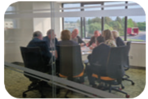
What concepts ideas are discussed