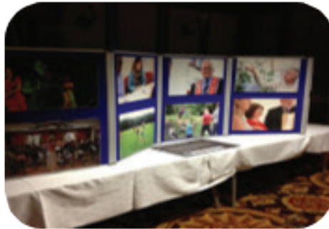
The Orange Order put on a display in a co-design Workshop